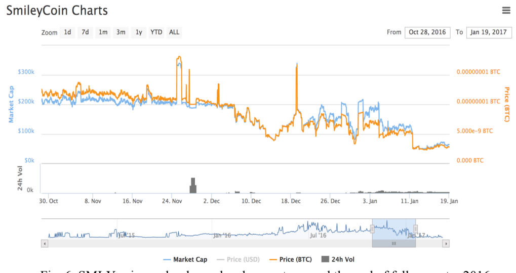
Fig. 6. SMLY price and volume development, around the end of fall semester 2016.

their SMLY and selling them en masse for the first time. This type of behavior in relation to the Bitcoin price seems (qualitatively) different from the behavior of other coins such as Litecoin and Dogecoin.